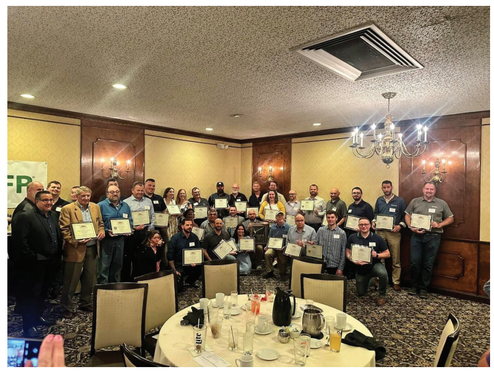
2023 NESCA Safety Award Winners